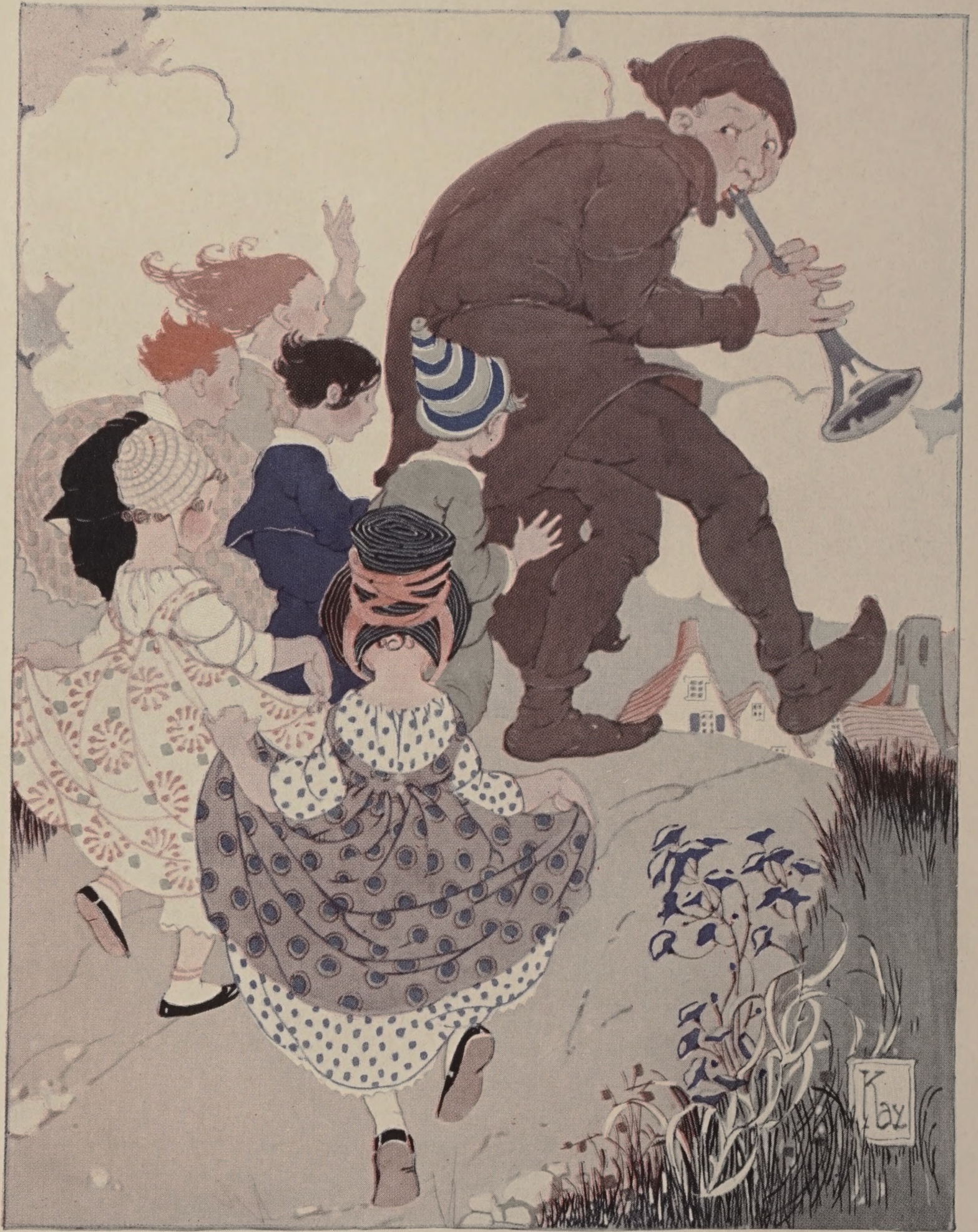
The children would not listen, but kept dancing along behind the piper